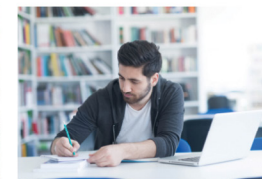
How to Use Writing Feedback