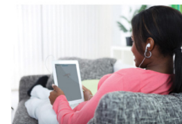
How to Use a Whiteboard